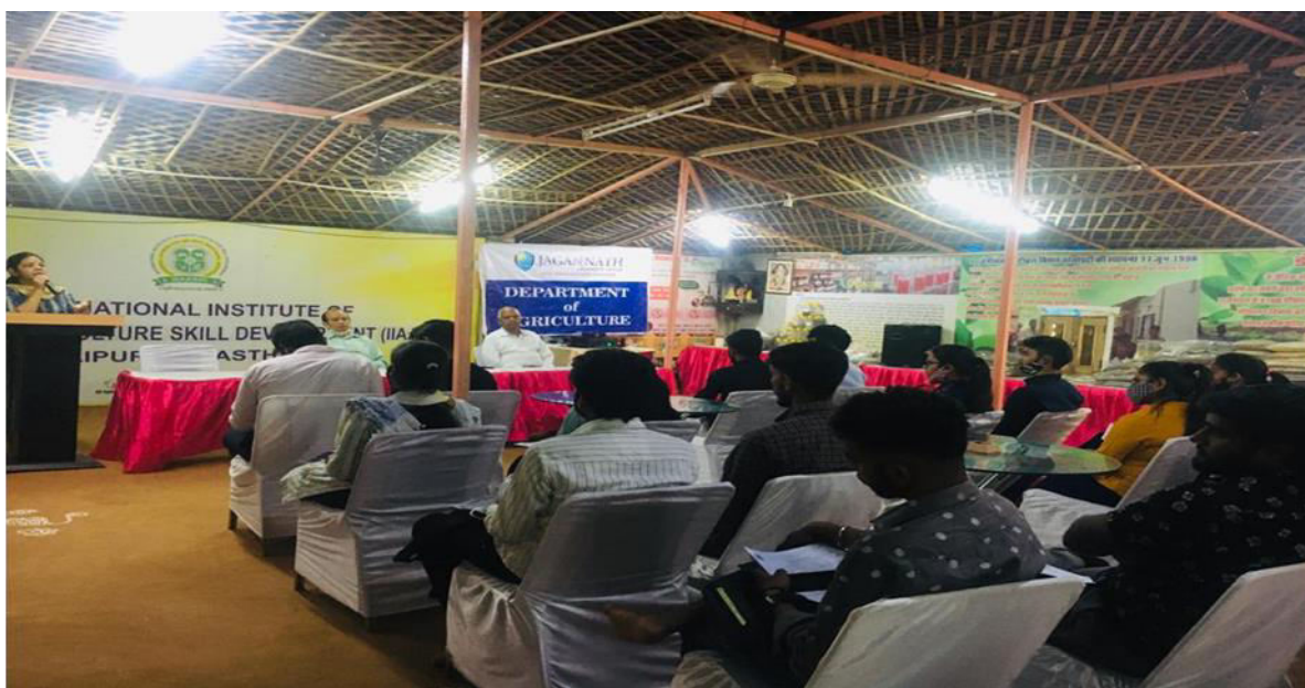
Students in International Institute of Advance Agriculture Skill Development (IIAASD)

Department of Agriculture has MoU with International Institute of Advance Agriculture Skill Development (IIAASD), Jaipur for the training of the students. Final year students attached with institute for three weeks for skill development training for production and use of organic products used in agriculture.