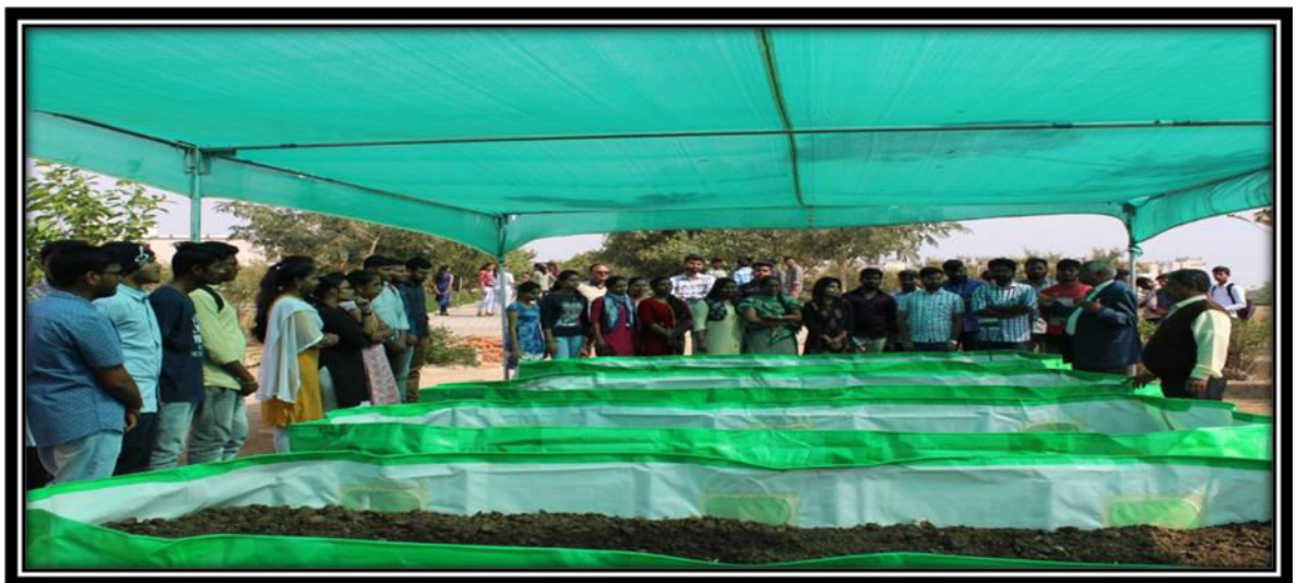
Vermi Compost Unit