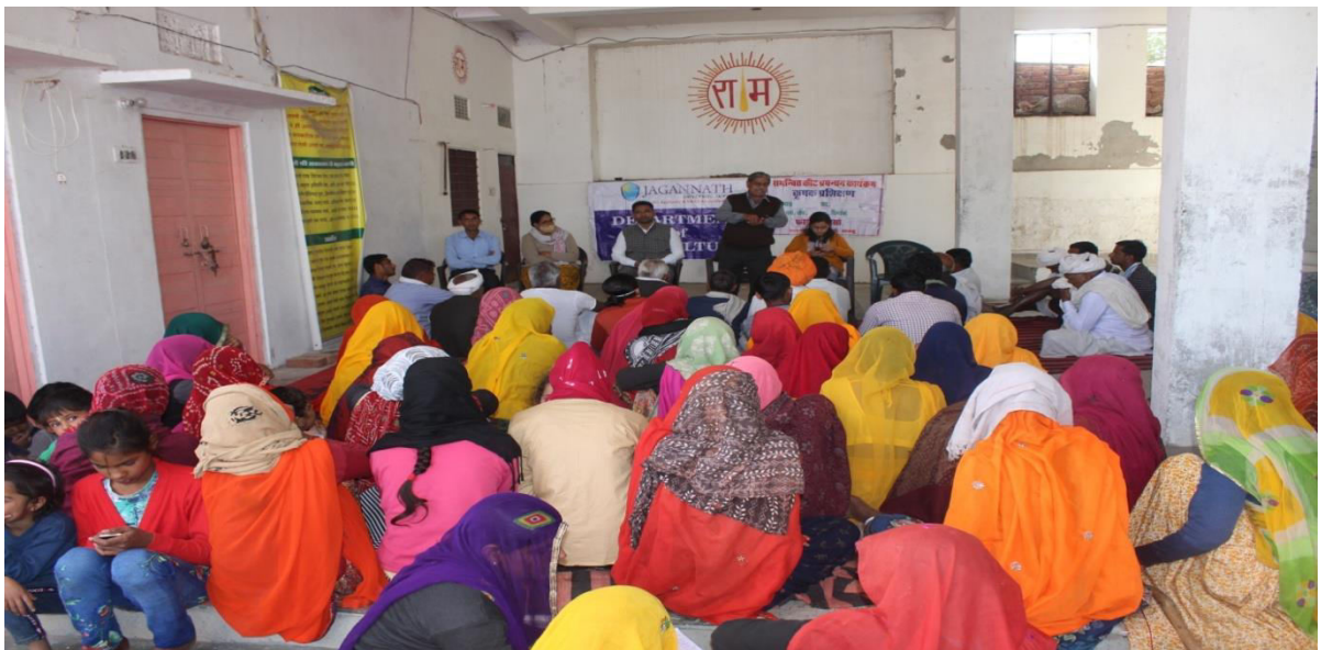
Farmer training programme on Integrated Pest Management in Mustard