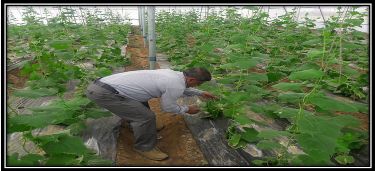
Cultivation of Cucumber in Poly House