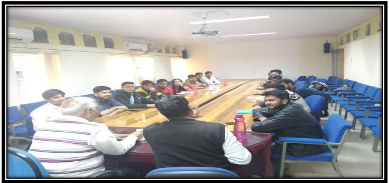
Students during RAWE programme in RARI, Durgapura, Jaipur

Department also designed a manual for the RAWE Programme which submitted by the students along with photographs at the time of evaluation.