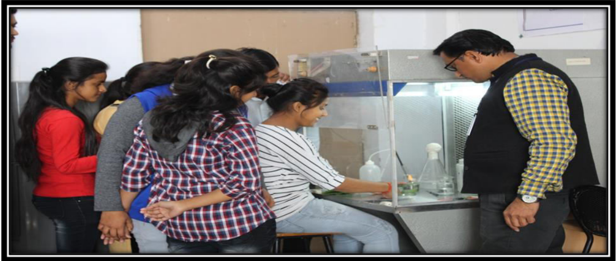
Inoculation of ex-plant by students in Bio-technology lab

The Department has 13 functional laboratories of different disciplines of agriculture. It has established the laboratories according to the 5 th Dean Committee recommendation of ICAR. Students use resources of the laboratories to solve problems, perform developmental experiments and work on projects guided by faculty. Each section divided into two practical class not more than 30 students (eg. A1 and A2) and all practical classes are conducted in laboratories and fields. Practical manuals have also been developed by the faculty members according to practical syllabus of that particular subject.