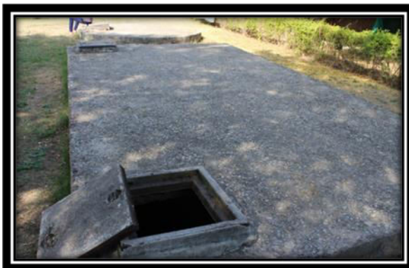
Rain Water Harvesting Tank