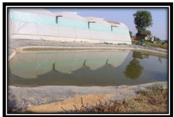
Water Harvesting Pond