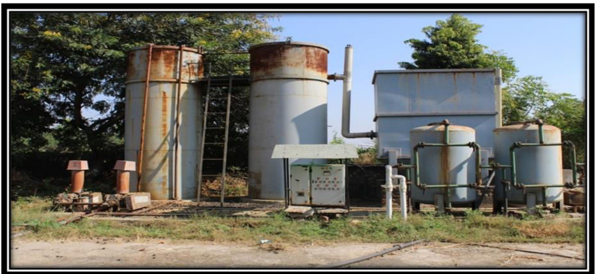
Wastewater Treatment Plant