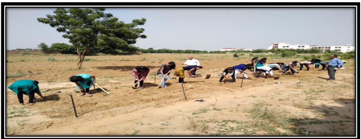
Seed bed preparation by the students

Practical Crop Production is also strengthening the knowledge of students about crop production techniques in rabi and kharif season. The Department has allotted sizable area to students in 10 groups in kharif and rabi season. The students are doing all agronomical practices practically in the field in allotted area from land preparation to harvesting including sowing, weeding, irrigation, plant protection etc. Main crops allotted to students during kharif season are Pearl Millet, Cluster Bean, Moong Bean, Urd bean, Moth bean, Soybean, Sorghum, Cow pea and sesame. The crops of rabi season are Wheat, Barley, Mustard and Taramira. The main objects of these practical courses are to educate student about all the practical aspects of crop production.