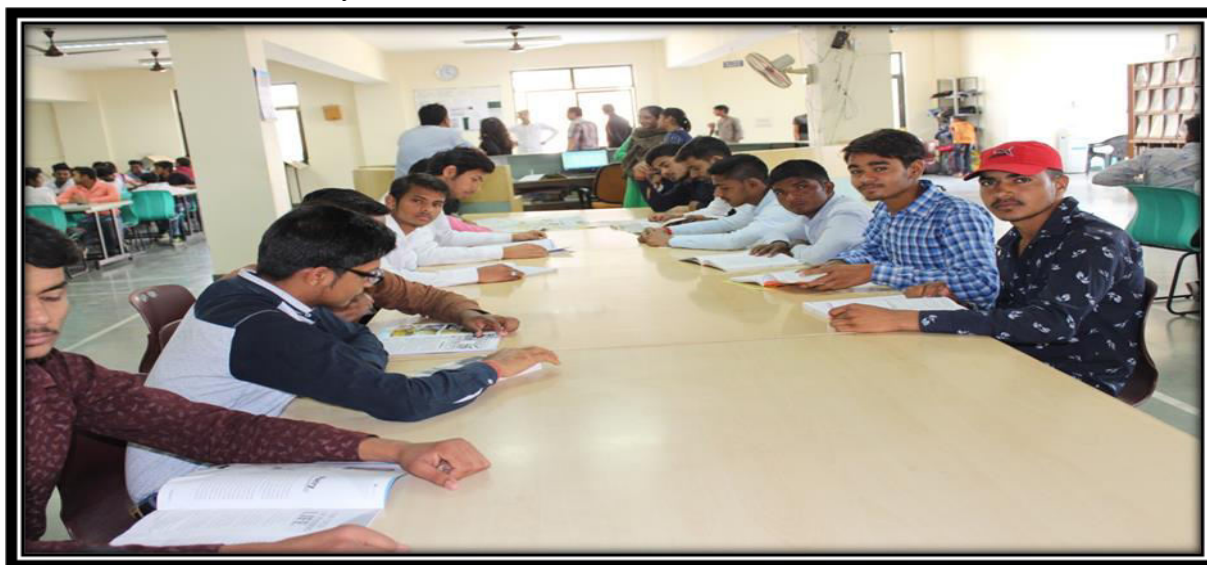
Central Library and Information System

All the faculty members have been provided with a table, chair, visiting chairs and a sliding almirah besides some office stationery. Most of them have their own cabin.