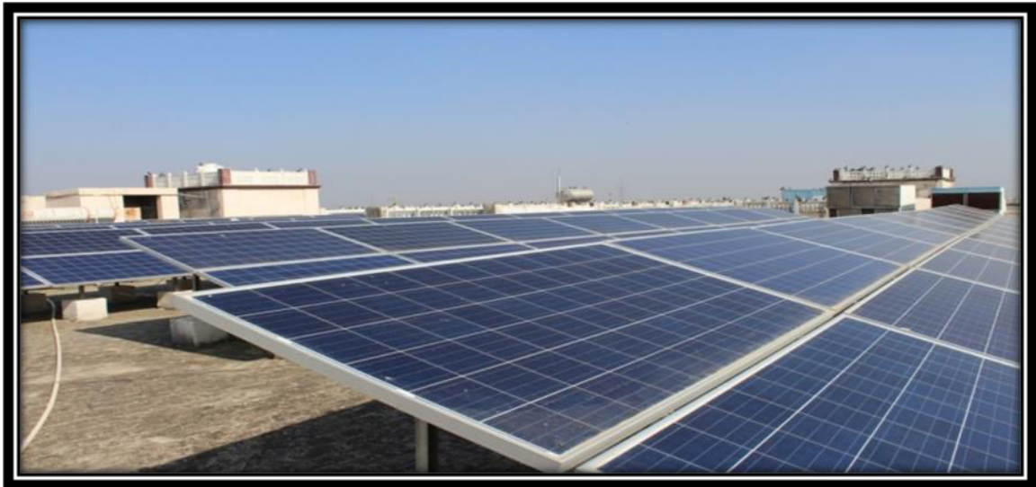
Solar Energy Unit