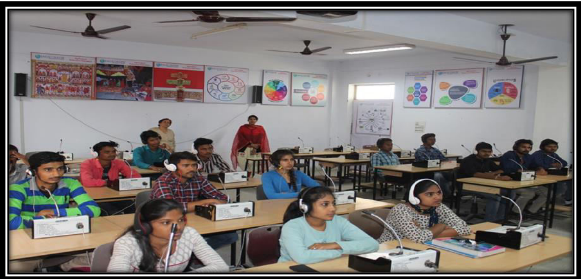
Agriculture Extension and Communication Lab