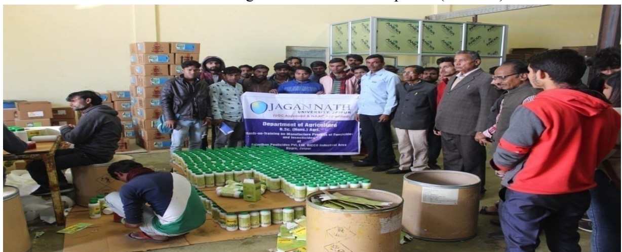
Students in Advance Micro Fertilizers (Pvt.) Limited, Jaipur during industrial attachment