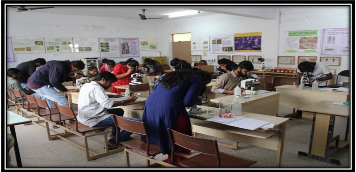
Plant Pathology Lab