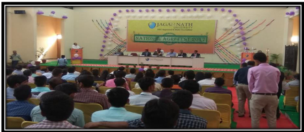
Guests and participants in National Agri-Fest 2017