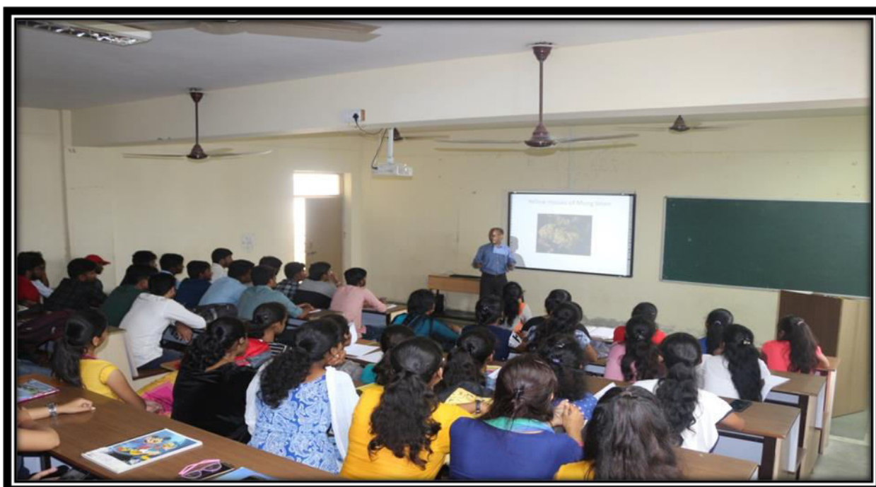
Smart Class Room